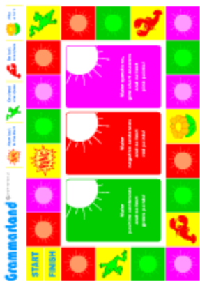
a game board