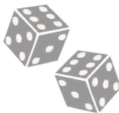
two dice for each player