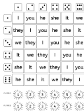
a game board