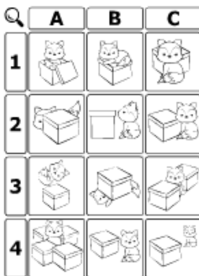
a game board