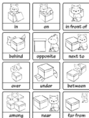
a picture dictionary board