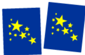
a set of star markers