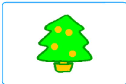
December 25th Christmas

New Year's Day is on the first of January.