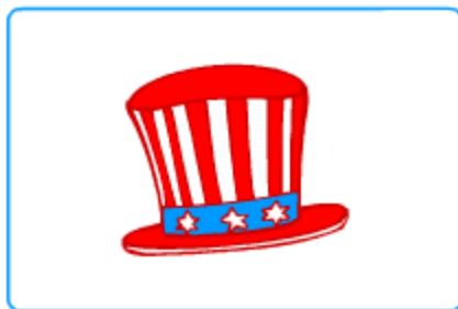
July 4th Independence Day