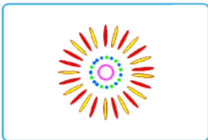
November 5th Guy Fawkes Day