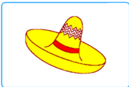
May 5th Cinco de Mayo