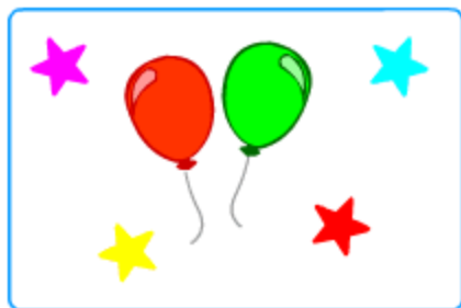
January 1st New Year's Day