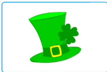
March 17th St. Patrick's Day