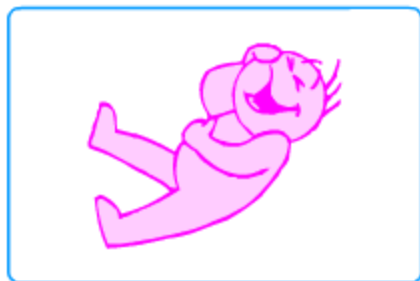
April 1st April Fool's Day