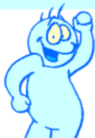
He can dance.