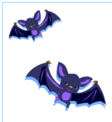
Bats can fly.