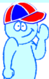
He can speak English.