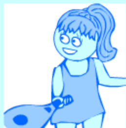
She can play tennis.

We use can to talk about what we are able to do.