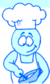
He can cook well.