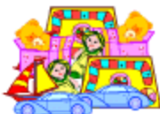
a lot of toys lots of toys