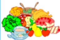
a lot of food lots of food