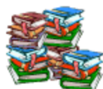
a lot of books lots of books