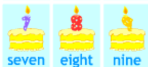
a game board