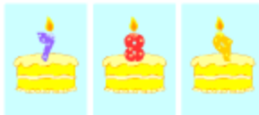
a game board