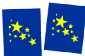
a set of star markers