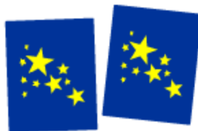
a set of star markers