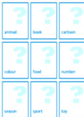
a game board