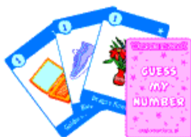
6 sets of playing cards