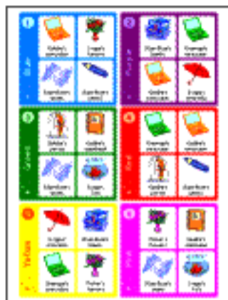
a game board