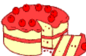
a cherry pie