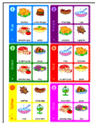
a game board