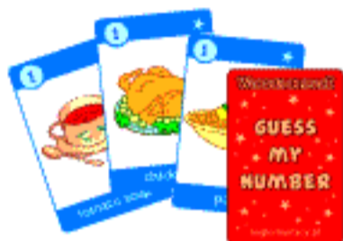
6 sets of playing cards