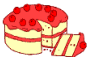
a cherry pie