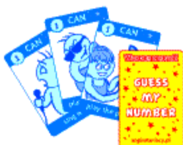
6 sets of playing cards