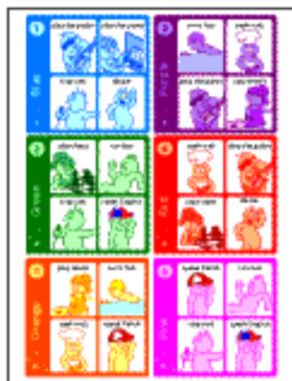
a game board