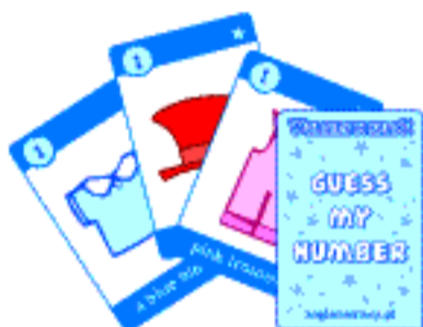
6 sets of playing cards