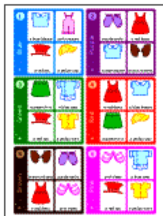
a game board